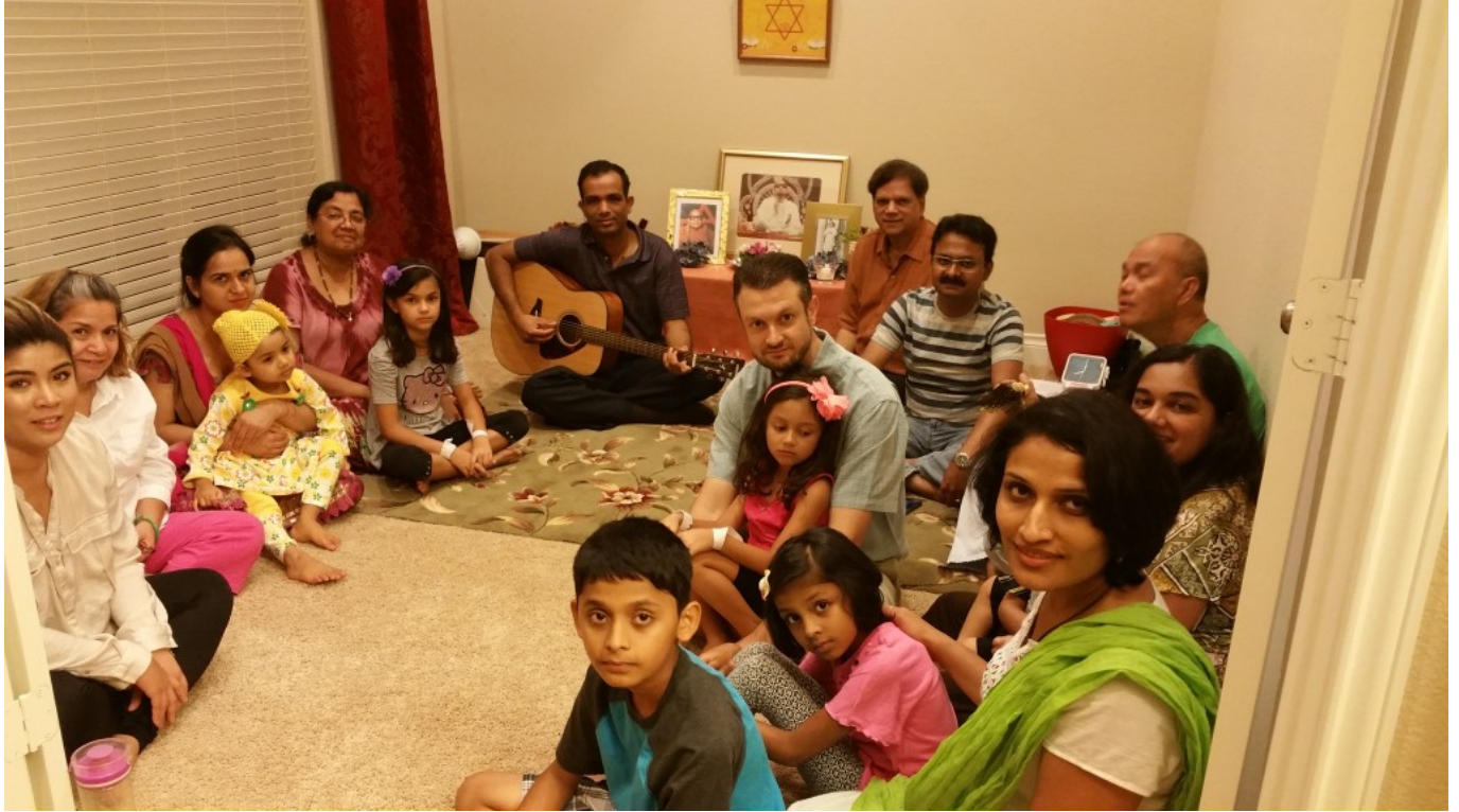
Image from Houston unit's Prabhat Samgiit celebrations held on Sept 12th.