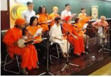
RAWA Taipei-Wenshan Unit