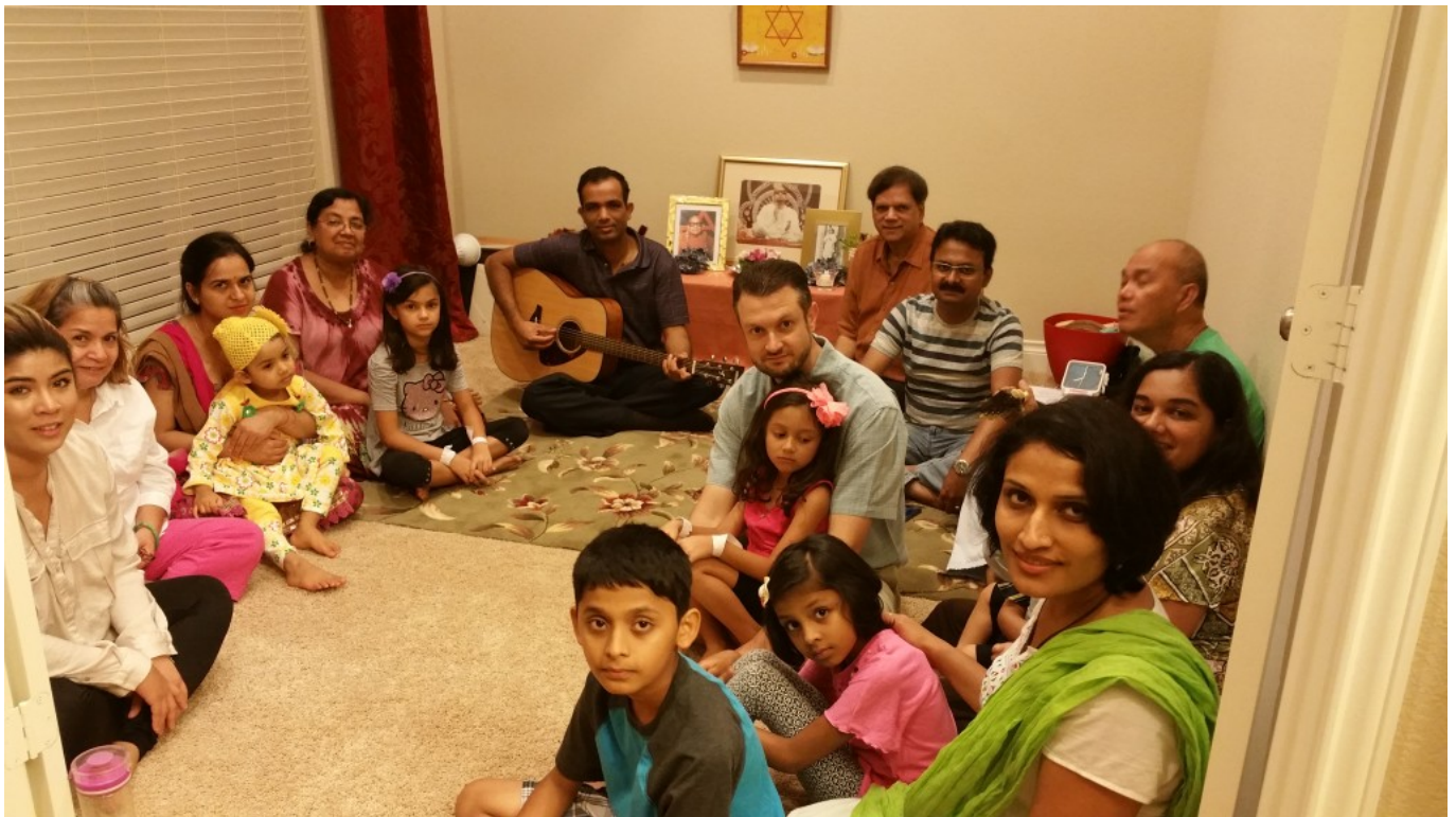
Image from Houston unit's Prabhat Samgiit celebrations held on Sept 12th.